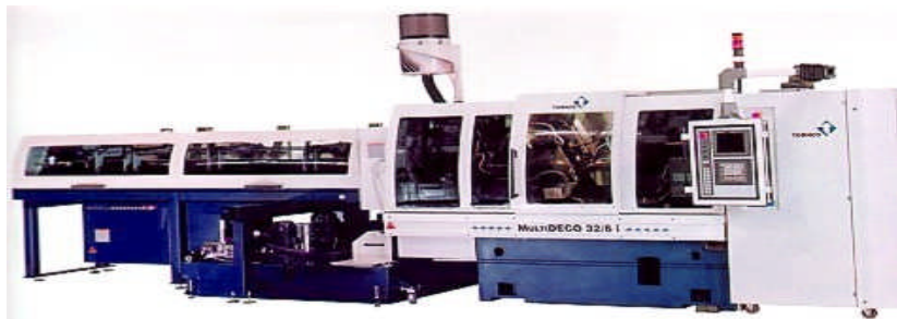
CNC Multi Spindle Lathes, Bar Capacities: 16mm to 32mm