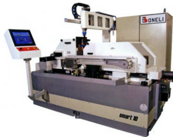
CNC Centerless Grinders, Through Feed & Plunge Grind