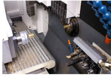
CNC Swiss Type Lathes – Bar Capacity: 13mm, 20mm, 32mm, 38mm