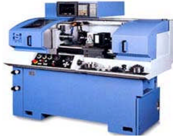
CNC & Manual Precision Lathes For Hard Turning, & Prototyping