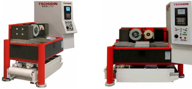
CNC Centerless Plunge Grinders, Up To 6 Diameters @ a Time