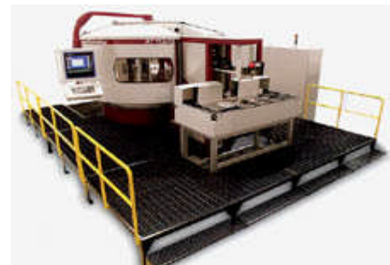
Transfer Machines: Rotary, Trunnion, In-Line, Pallet Type