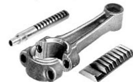
Broaching Machines, Tooling, Fixtures, Automation, Production